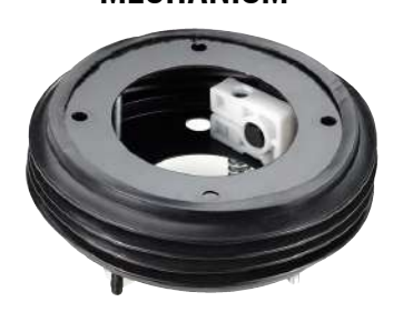
Hole to hole = 12cm