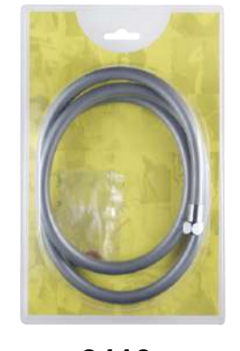
PVC SHOWER HOSE