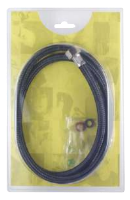
NYLON SHOWER HOSE