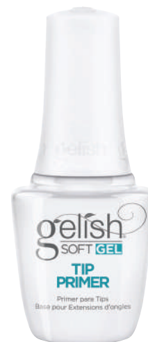
SOFT GEL TIP PRIMER