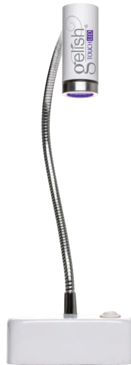
TOUCH LED LIGHT

Step 7 Cure all five fingers for 60 seconds in the 18G LED LIGHT .