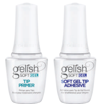
SOFT GEL TIP PRIMER