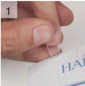
Step 1 Refine free edges using the 180/180 GRIT FILE .