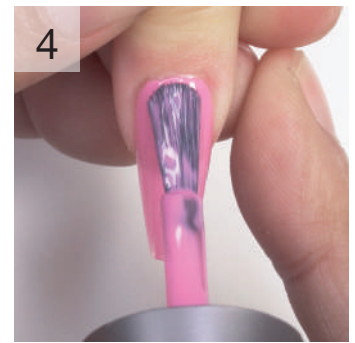
Step 4 Choose any GELISH or MORGAN TAYLOR finishing option.