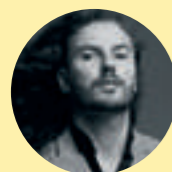
Aleksandar Dramicanin @aleksandar_dramicanin

“Playing with her natural colour and a combination of copper tones to enhance the shine and highlight her pale complexion.”