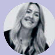
Grace Dagleish @gracedagleishx

"I customised three bespoke colour mixes and visually layered them together to create a seamless multi-dimensional result, while still showcasing my model's natural texture and movement, to create an effortless natural lived-in result."