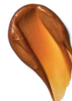
8-46 GLAZED CARAMEL