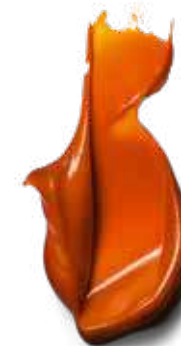
7-77 BRIGHT COPPER