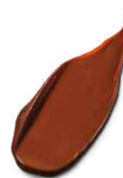
6-46 RAW CACAO