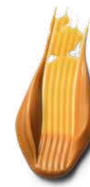
9.5-4 BEIGE SAND