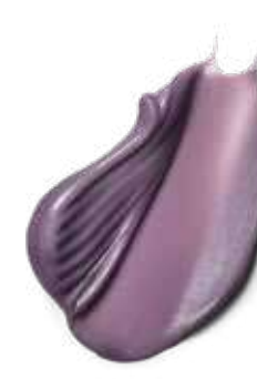
9-12 PLATINUM GREY