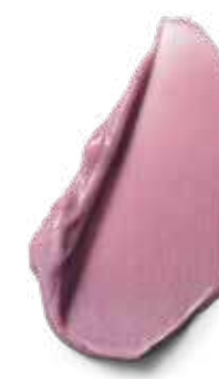
9.5-19 DUSTY PINK