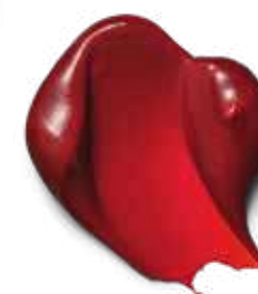
6-88 RUBY RED