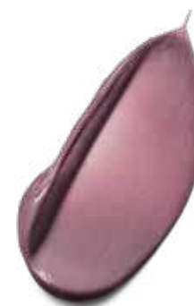
8-19 FROSTED LAVENDER