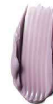
9.5-1 PEARL SILVER